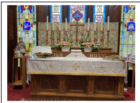
Historic Chapel – Holy Trinity – Melbourne – Altar