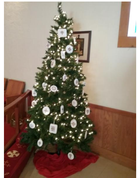
Lit on Christmas Eve

St. John's has two trees, one at each end of the altar rail. We divide the 54 ornaments between the two trees, placing a few ornaments on each tree each Sunday in Advent. The finished trees are lit on Christmas Eve. In the photos, there are only 24 on each tree because we were not even finished with the first set. This year will be the first year with the complete set in place.