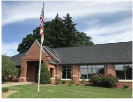
Calvary Church Fletcher NC