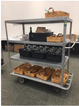
Cart ready to take Bread & Wine out