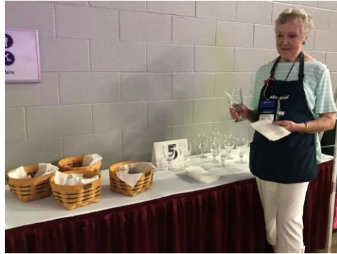
Eucharist Station with Chalices & Bread Baskets