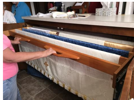
Hanging Frontals in the Sacristy