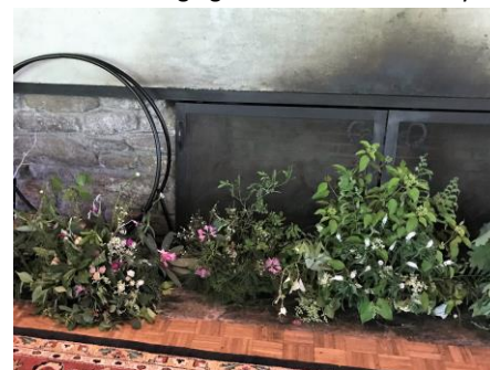
Some of the Altar Worthy Arrangements

The conference included much more – music, a Taize service, social time, exchange of ideas, worship services, a business meeting, election of officers, videos, blessing of the hands, and lots of wonderful meals. The conference is open to all altar guild members. If you would like to attend next year’s conference, watch for future news in this newsletter, or contact me for further information – jem2415@earthlink.net .