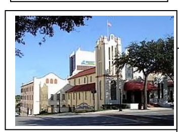
All Saints - Lakeland