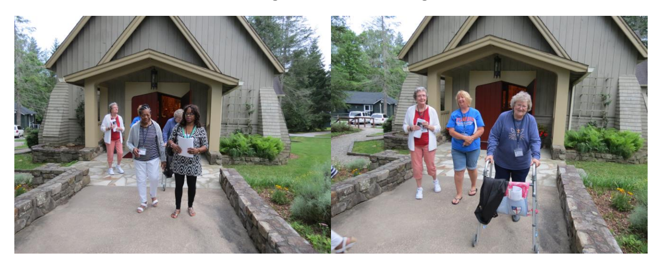
Friends and Family