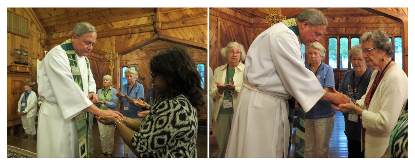
Closing Eucharist and Blessing of Hands